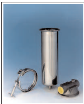
Industrial Grade Housing