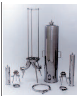
Sanitary Grade Housing